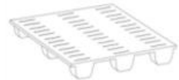
4-Way Plastic Pallet