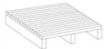
Pallet without bottom boards

Skids, bins and pallets without bottom boards are all loads that can be lifted by a fork over stacker